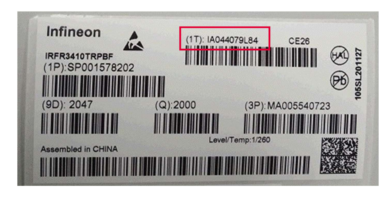
Lot number location on product's label