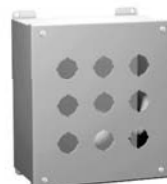
1437 Pushbutton Enclosure