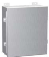
1414 NEMA 4X Stainless Steel Enclosure